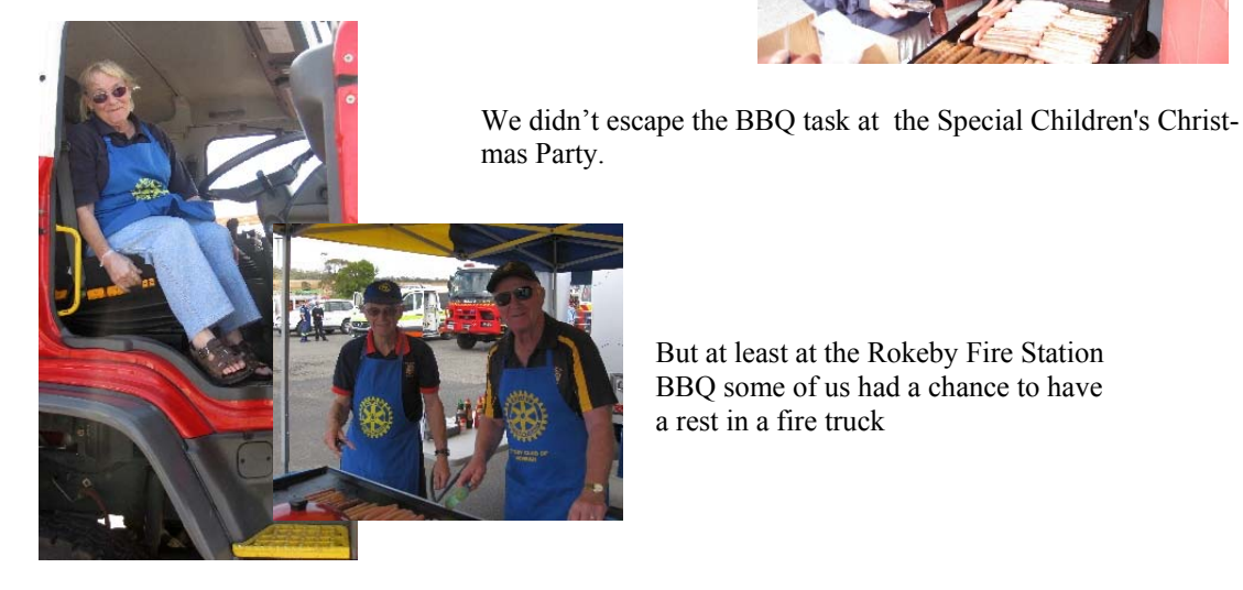
But at least at the Rokeby Fire Station BBQ some of us had a chance to have a rest in a fire truck