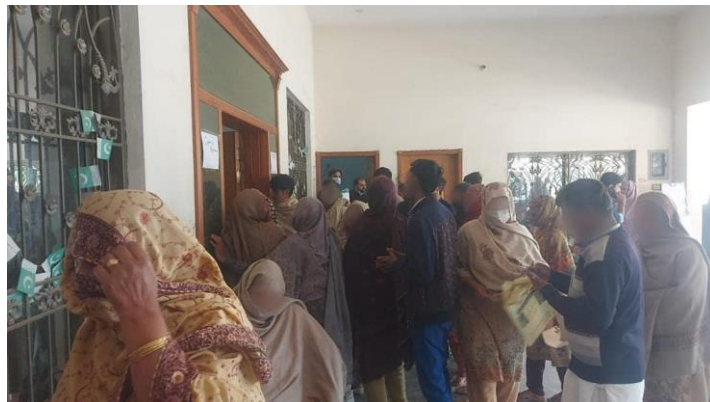
Patients awaiting their turn

The purpose was to provide a free healthcare facility to those around the country who can't afford to go to Doctors for their health issues. Their December 2023 clinic helped 1100 people providing free medicine and a variety of free tests including hepatitis and thalassemia screening tests.in the Feroze Wattwan, District Sheikhpura, Punjab, Pakistan