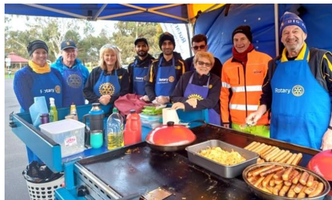
Our BBQ team at Glenorchy for Peter Gutwein's Walk Finish