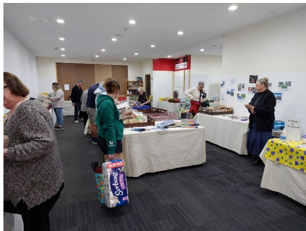
Our Shoreline Plaza Site