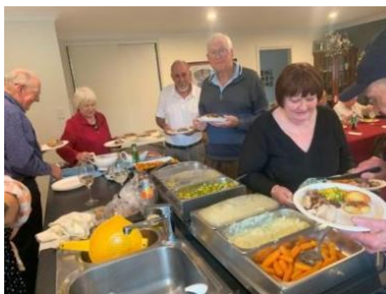
Meal at Gayle's - a great spread