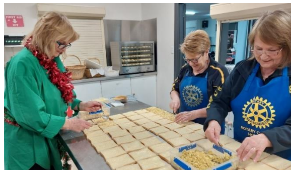
Homely Retreat Catering

Our members are continuing to participate in One Community Together , 26TEN Literacy Support , and Clarendon Vale Landcare activities.