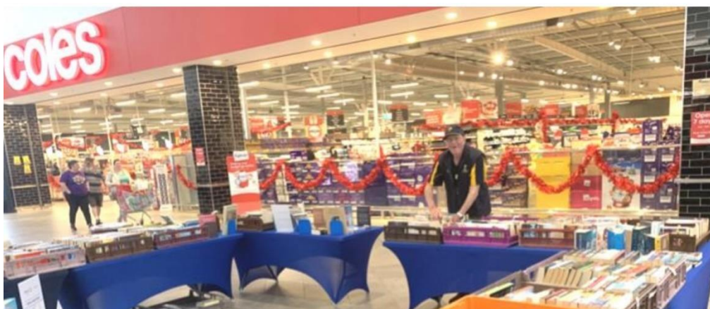
Glebe Hill Pop-Up shop